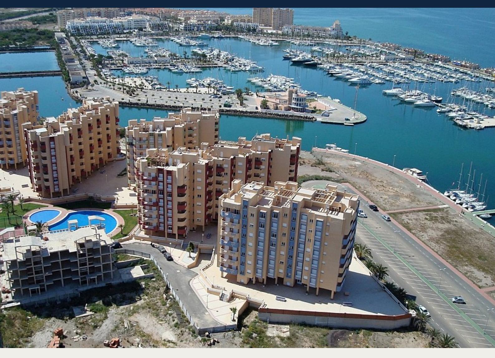
Lejlighed i La Manga del Mar Menor - Nybygget