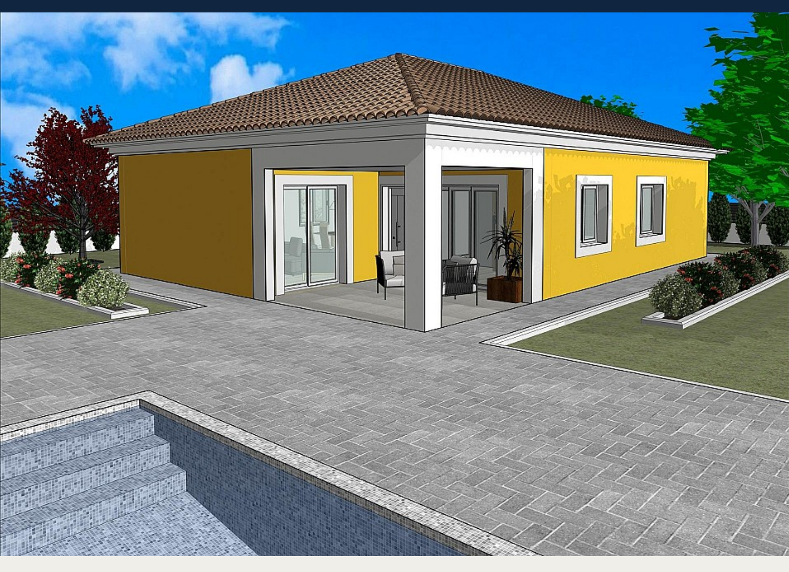
Villa i Pinoso - Nybygget