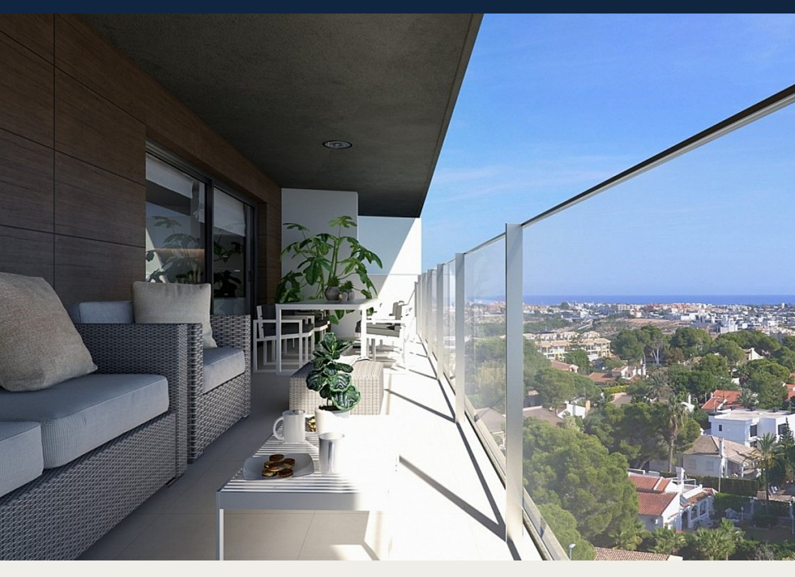
Lejlighed i Orihuela Costa - Nybygget