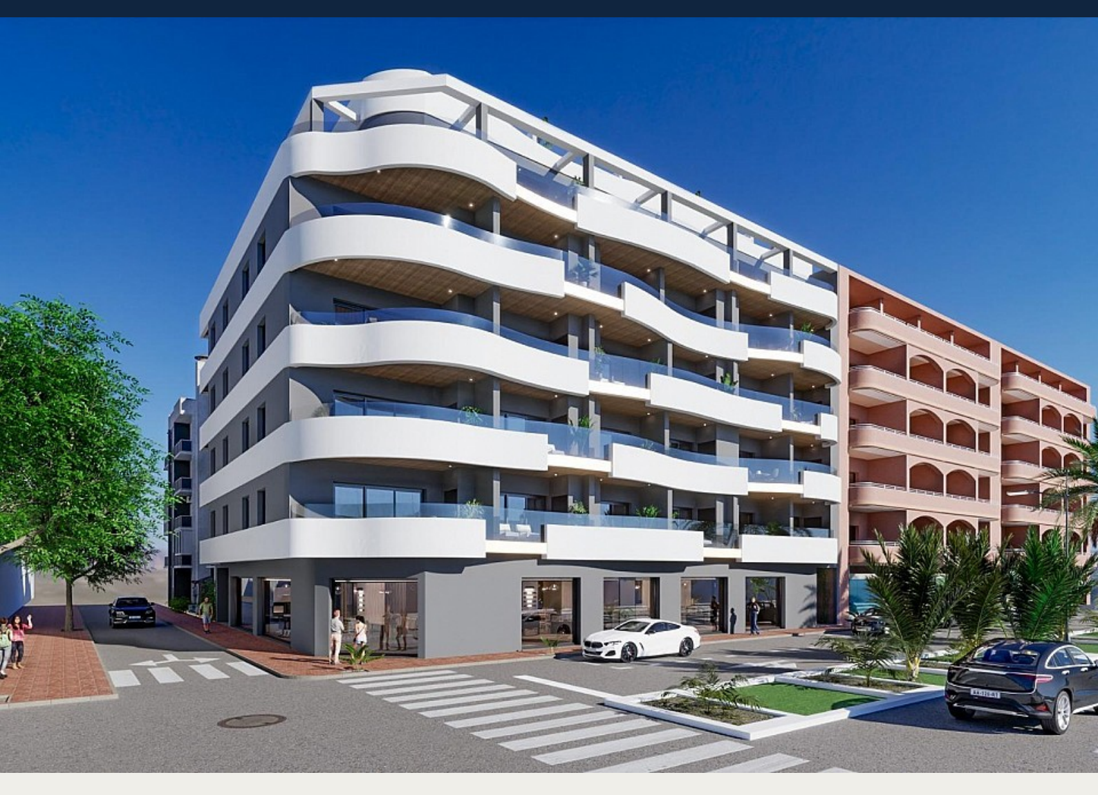
Lejlighed i Torrevieja - Nybygget