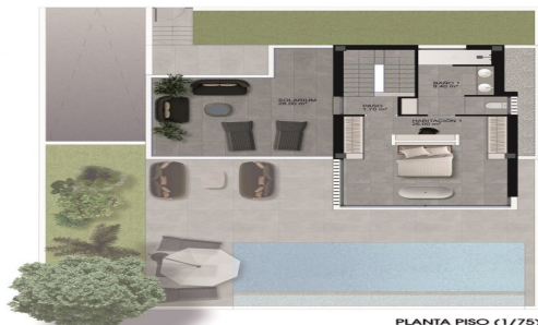
PLANTA PISO (1/75)

PARCELA 05 271.00 m 2 SUPERFICIE CONSTRUIDA SÓTANO 180.50 m 2 SUPERFICIE CONSTRUIDA PLANTA BAJA 80.90 m 2 SUPERFICIE CONSTRUIDA PLANTA PISO 45.50 m 2 SUPERFICIE CONSTRUIDA TOTAL 306.90 m 2 SUPERFICIE CONSTRUIDA TOTAL COMPUTABLE 208.80 m 2