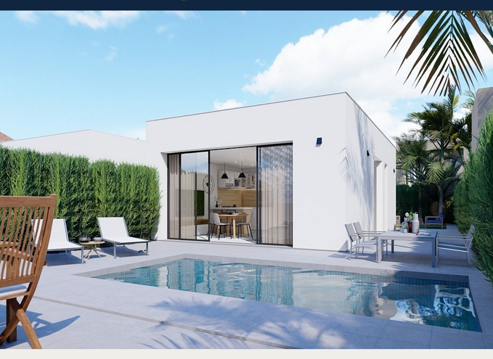
Villa i Los Urrutias - Nybygget