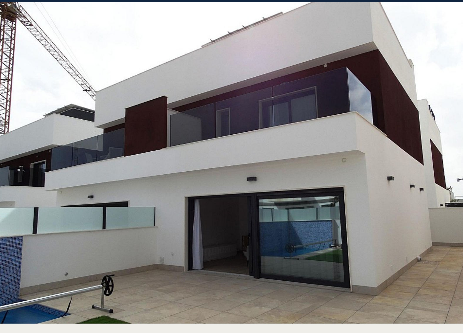
Villa i San Javier - Nybygget