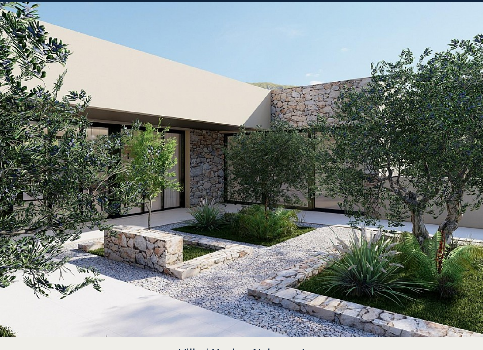
Villa i Yecla - Nybygget