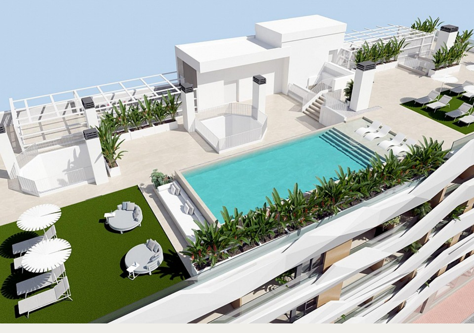
Penthouse i Guardamar del Segura - Nybygget