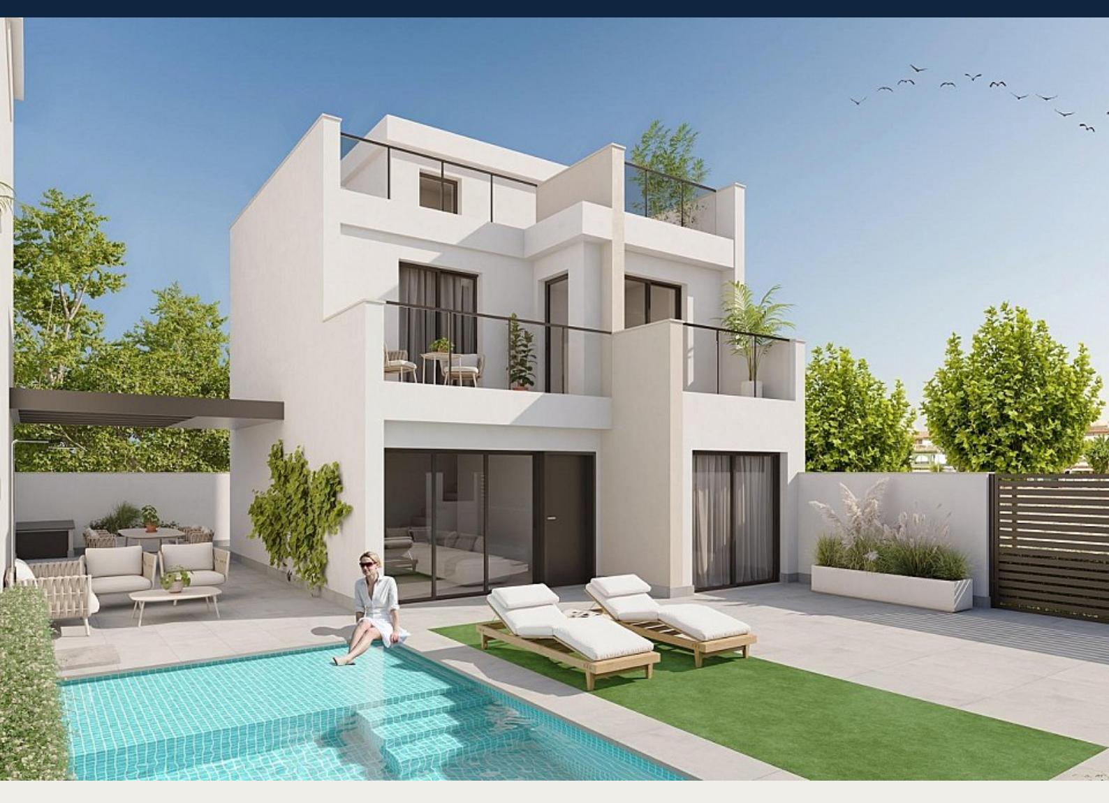
Villa i Los Alcázares - Nybygget