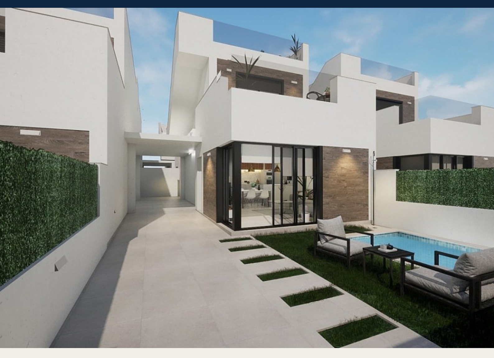
Villa i Los Alcázares - Nybygget