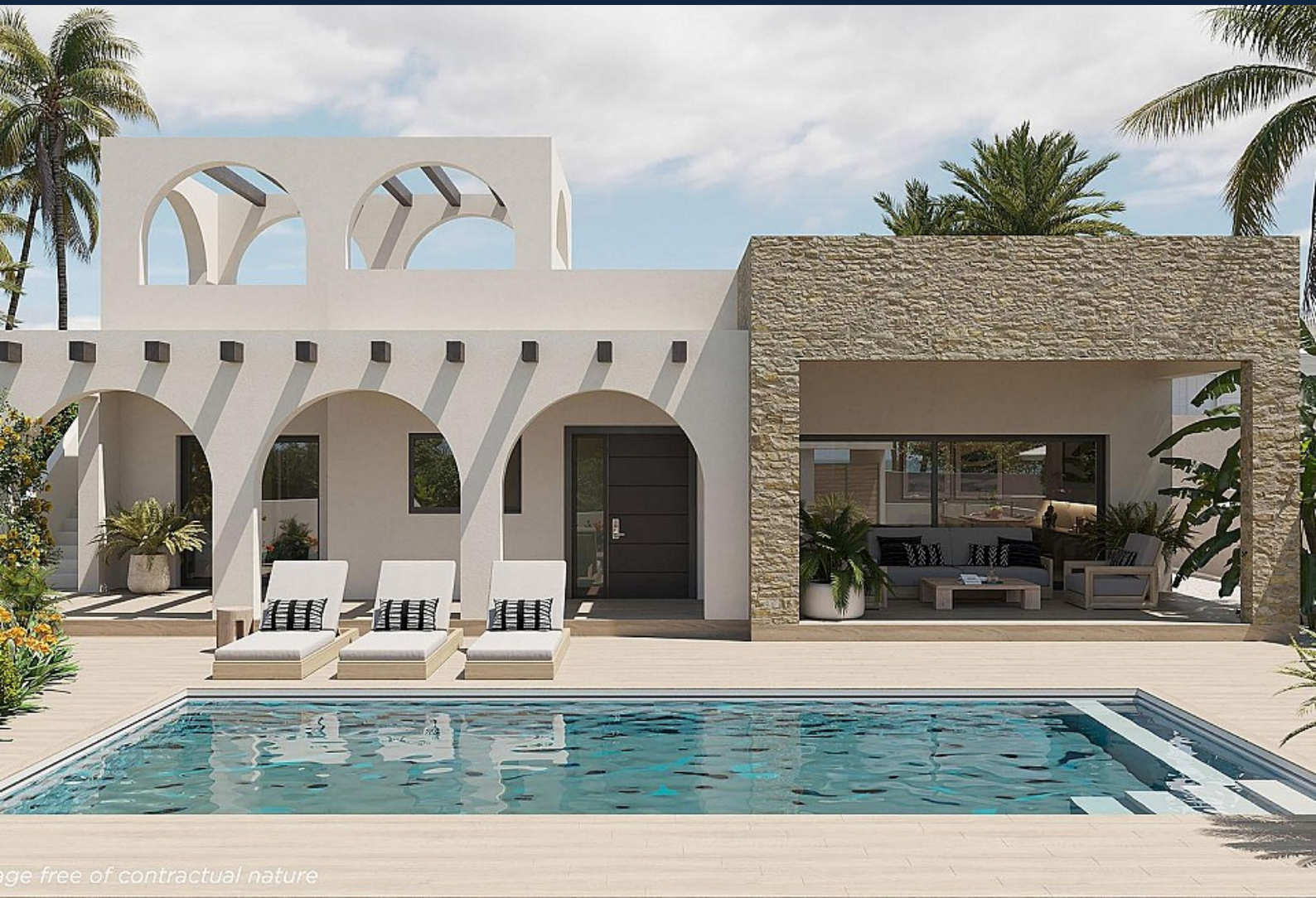
Image free of contractual nature