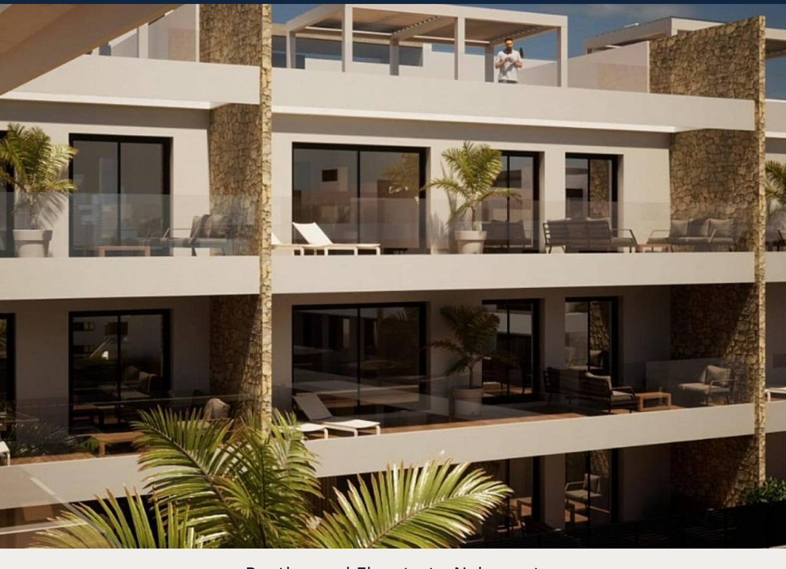
Penthouse i Finestrat - Nybygget