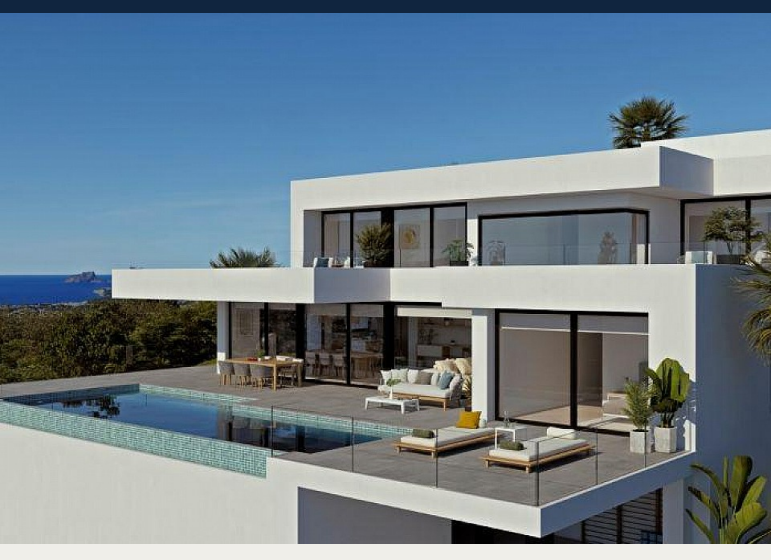
Villa i Benitachell - Nybygget