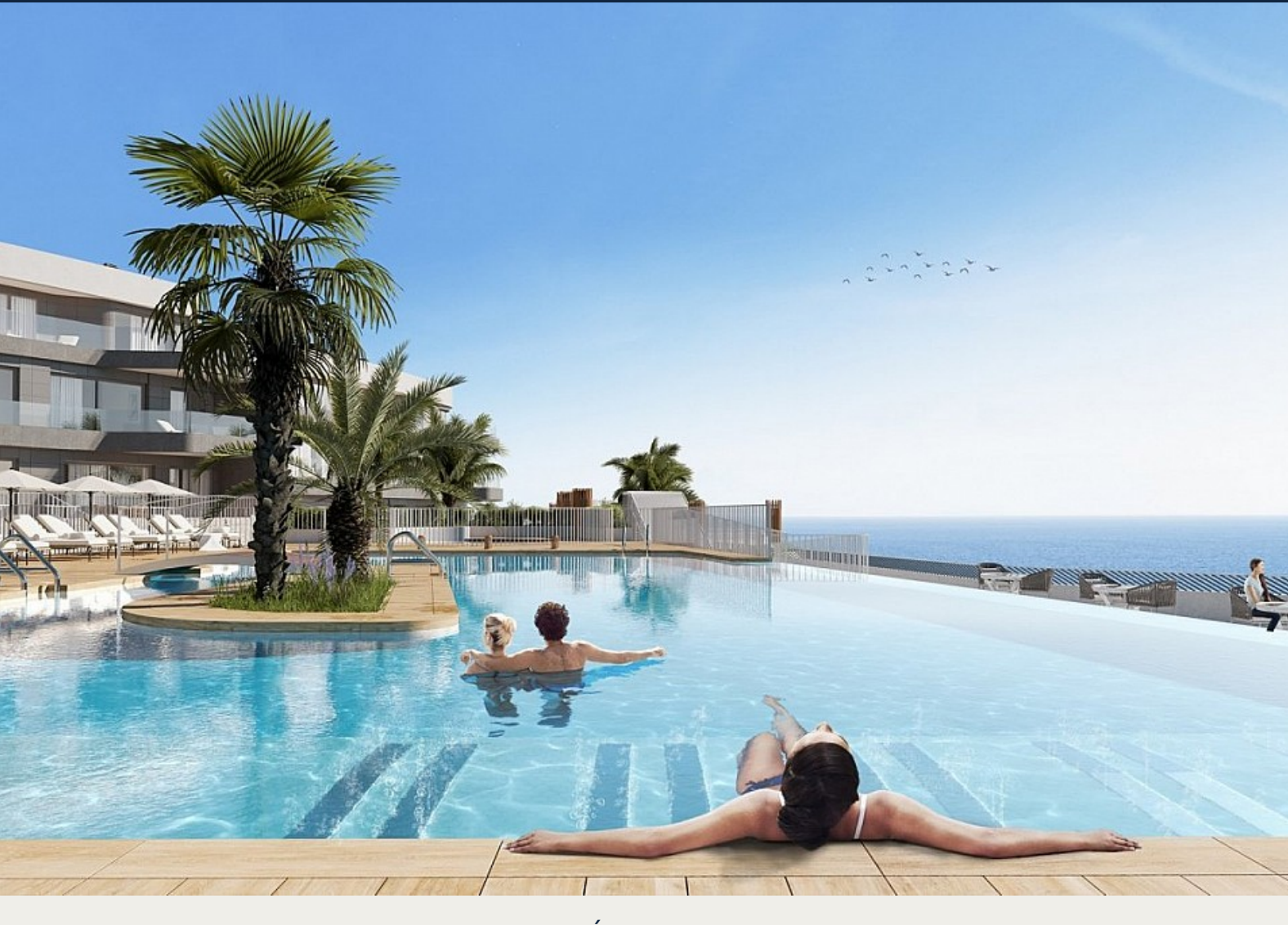
Lejlighed i Águilas - Nybygget