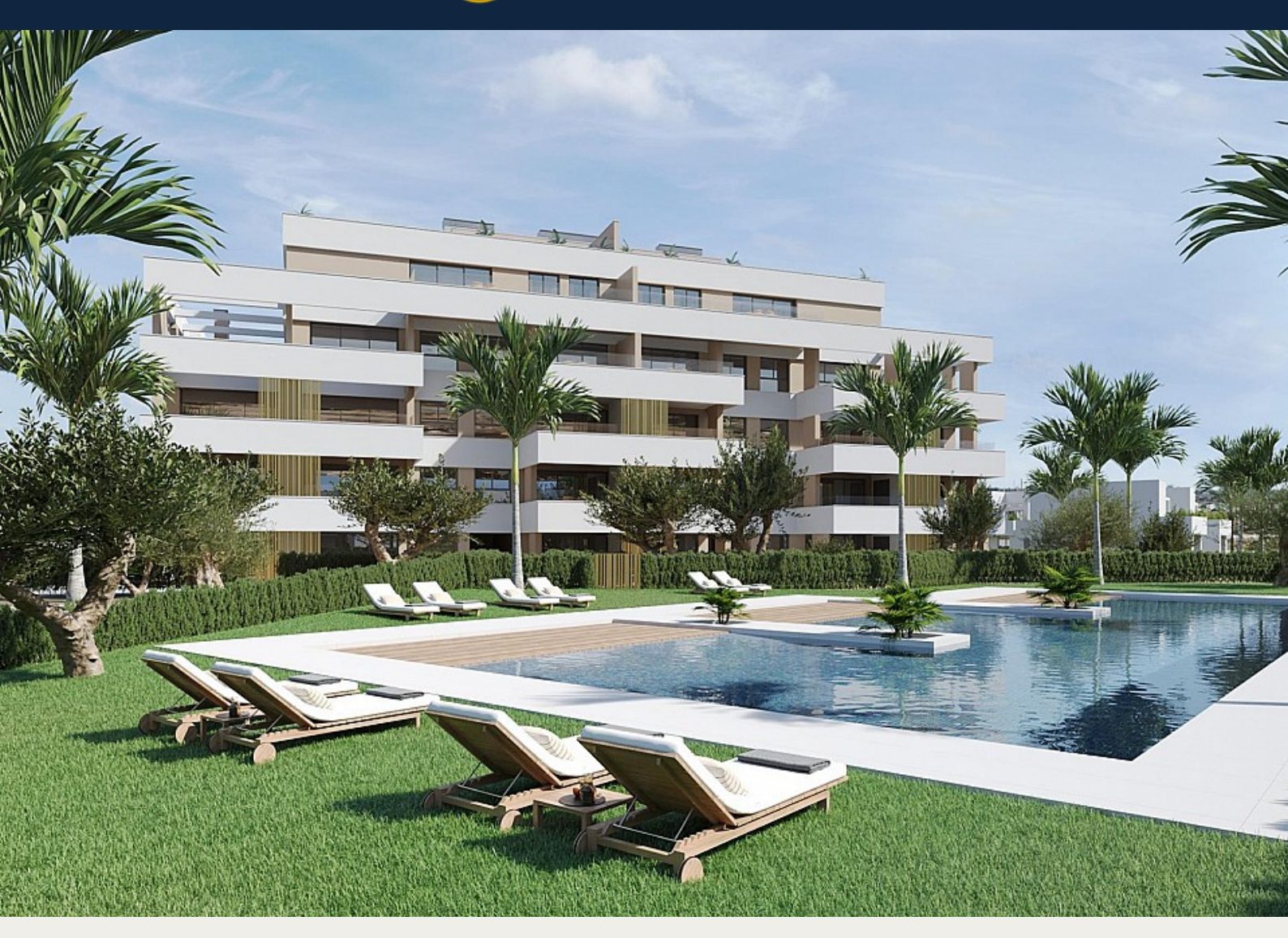
Lejlighed i Torre Pacheco - Nybygget