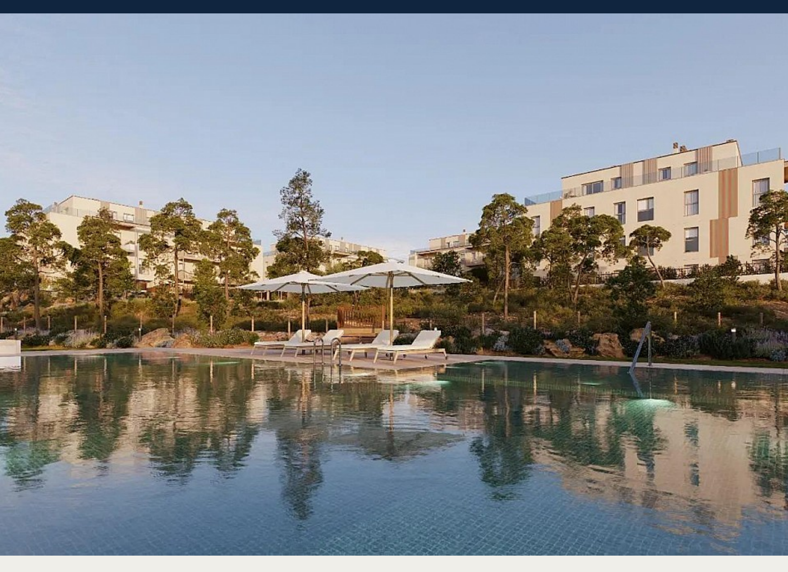
Lejlighed i Godella - Nybygget