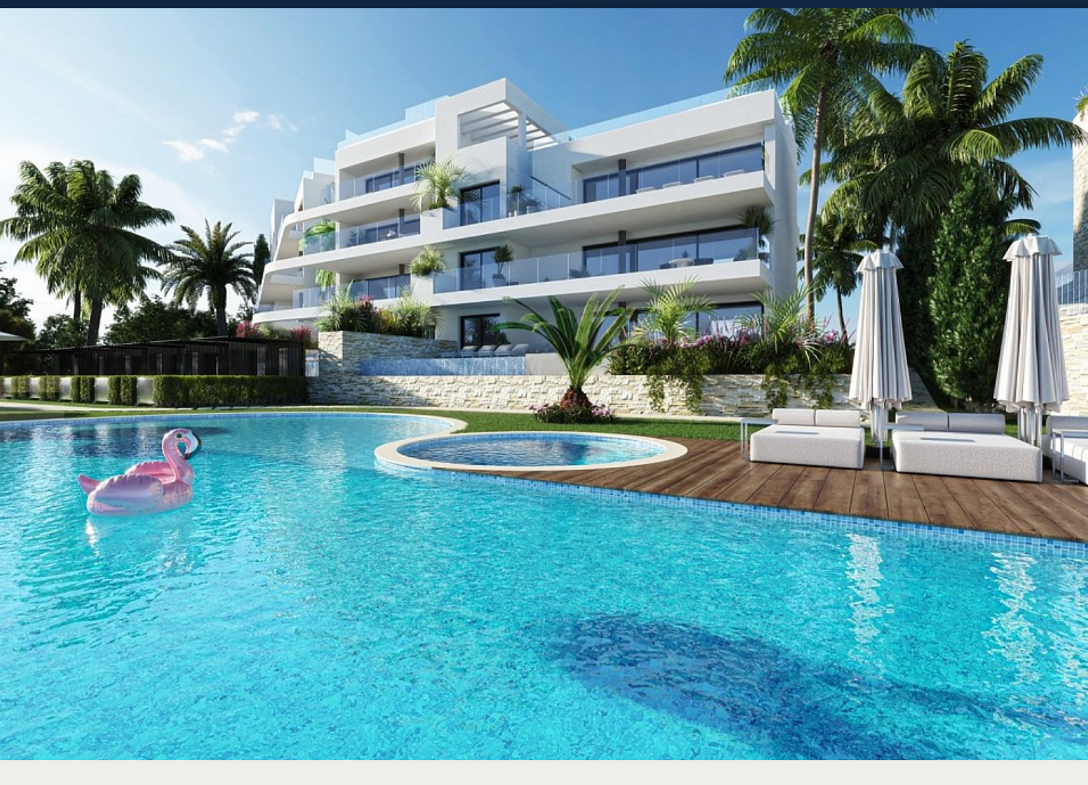
Lejlighed i Orihuela - Nybygget