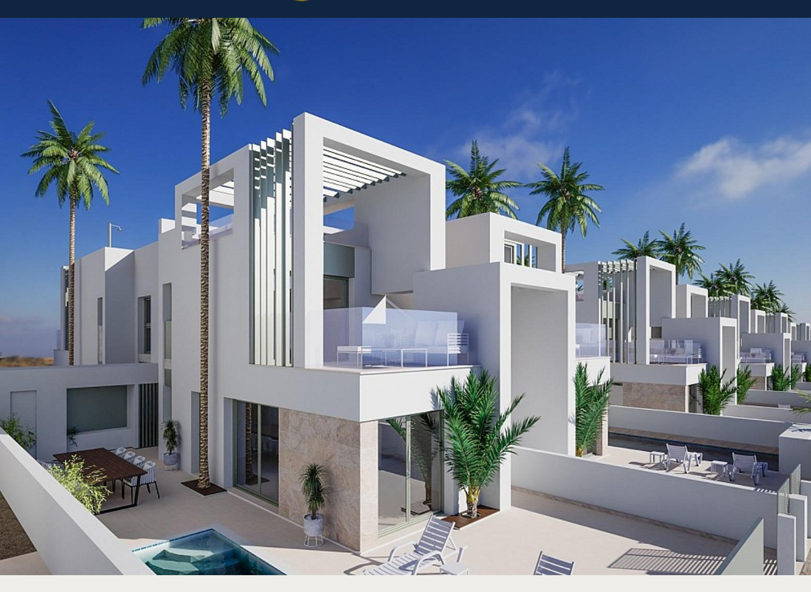
Dobbelthus i Rojales - Nybygget