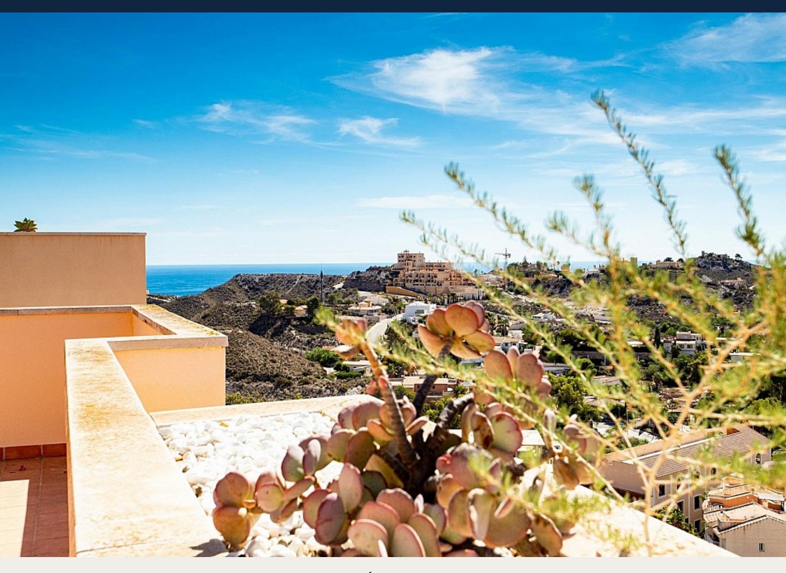
Penthouse i Águilas - Nybygget