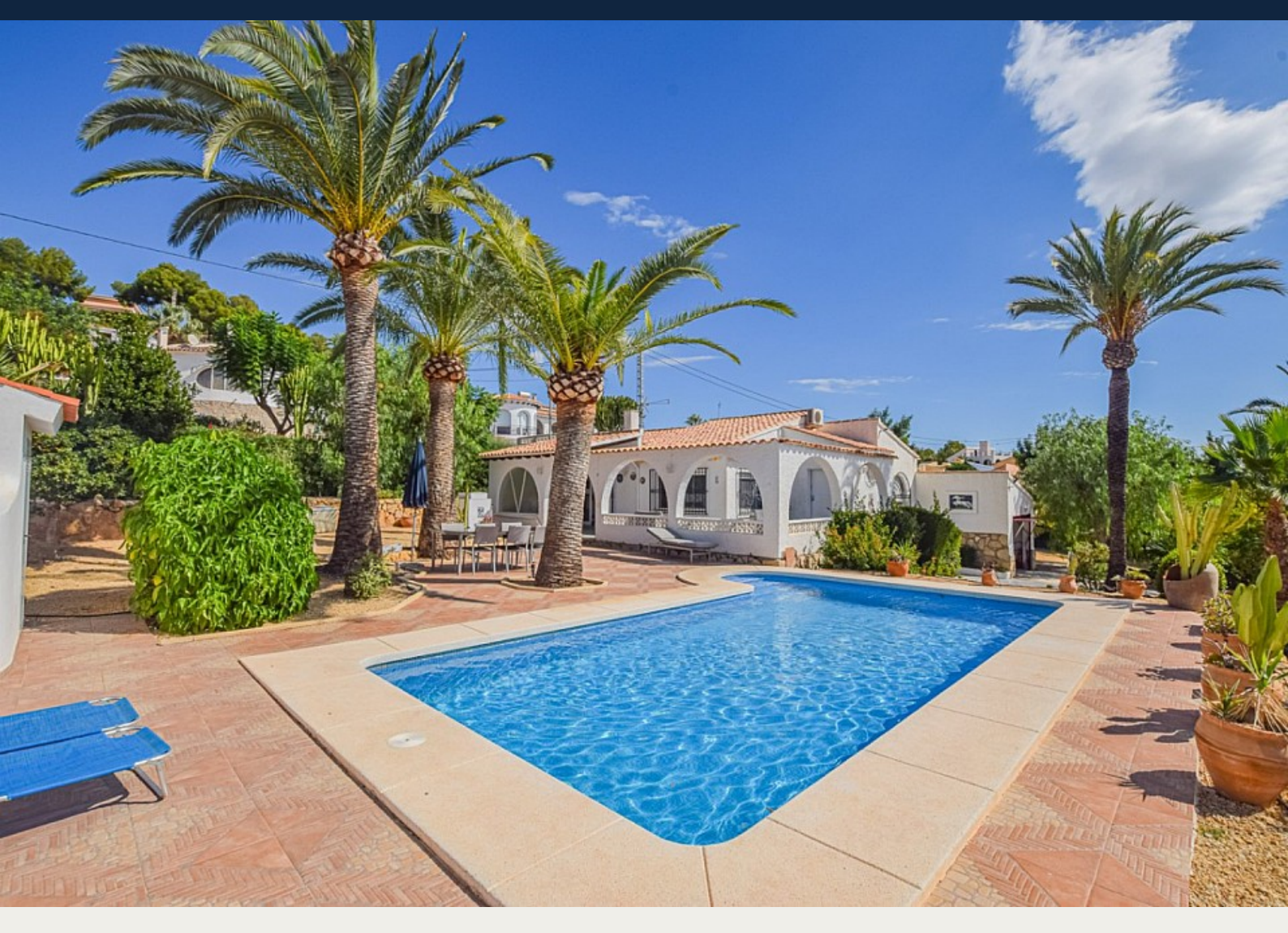
Villa i Alfas del Pi - Gensalg