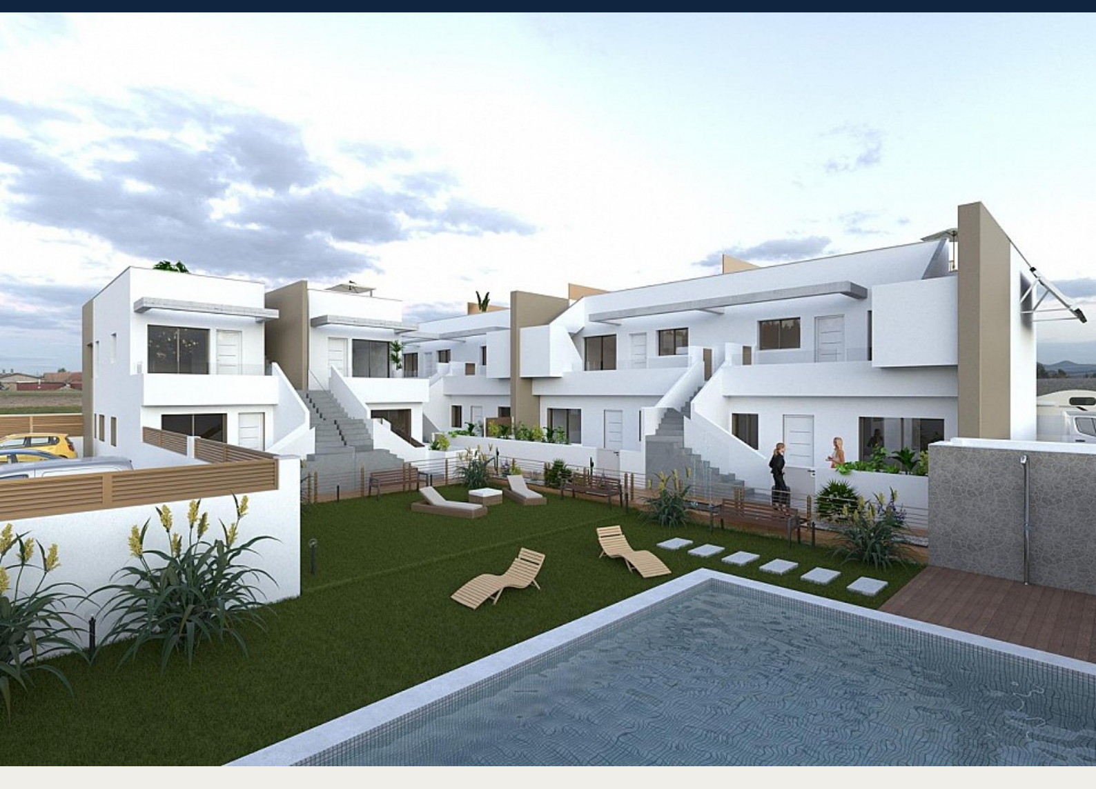
Bungalow i Pilar de la Horadada - Nybygget