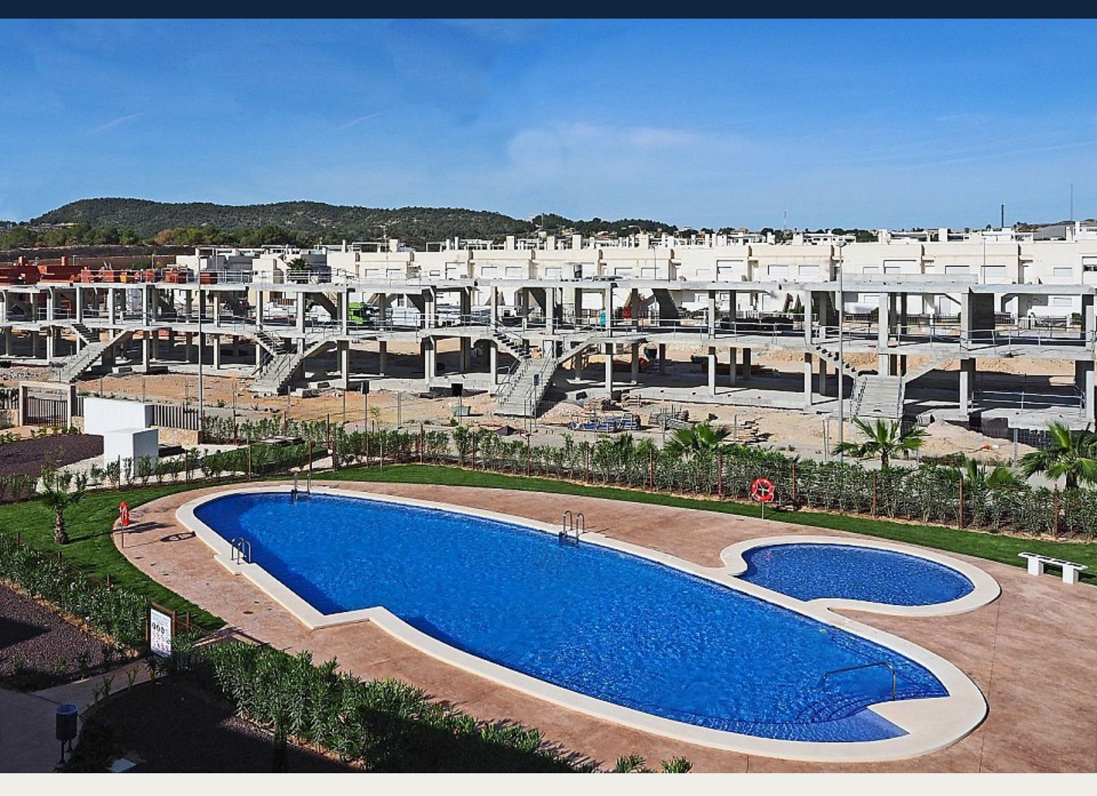
Villa i Orihuela - Nybygget