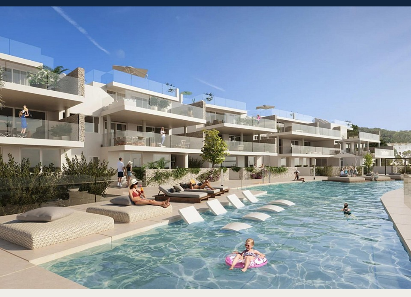
Lejlighed i 3409 - Nybygget