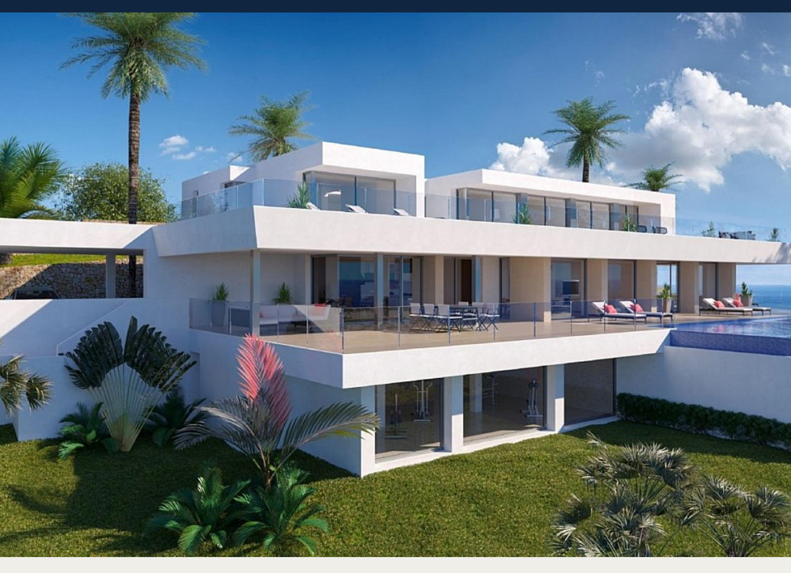
Villa i Benitachell - Nybygget