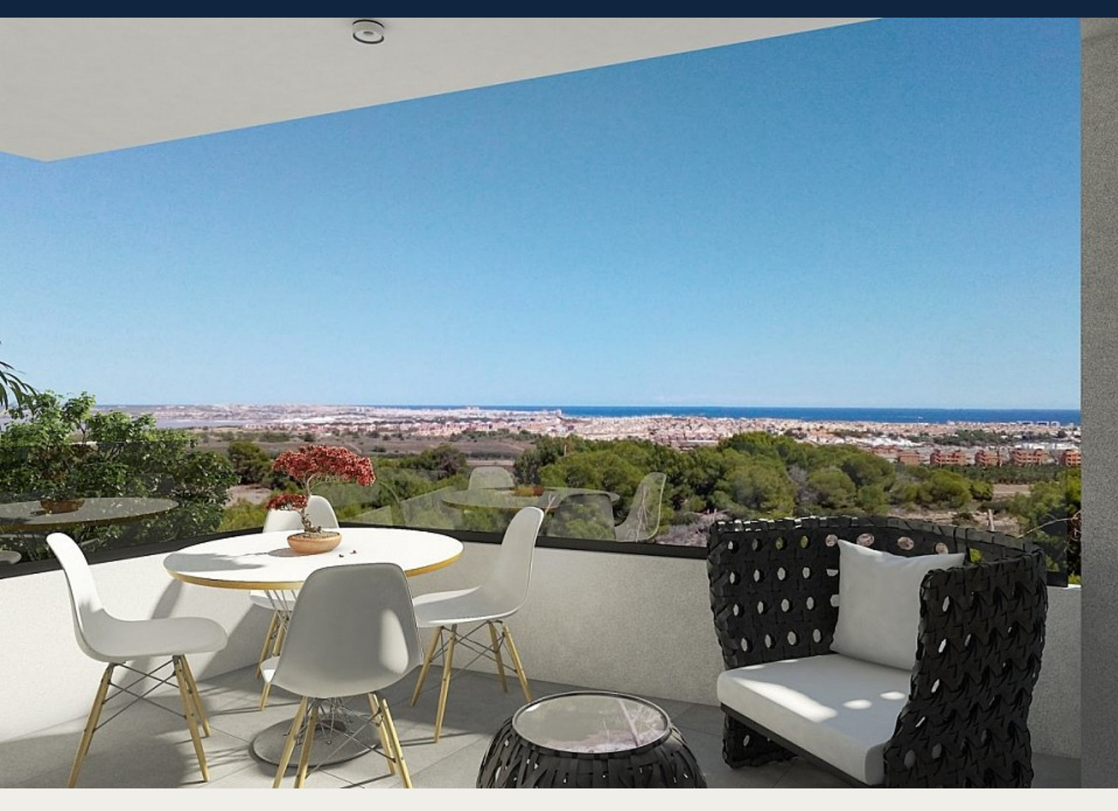
Lejlighed i Orihuela Costa - Nybygget