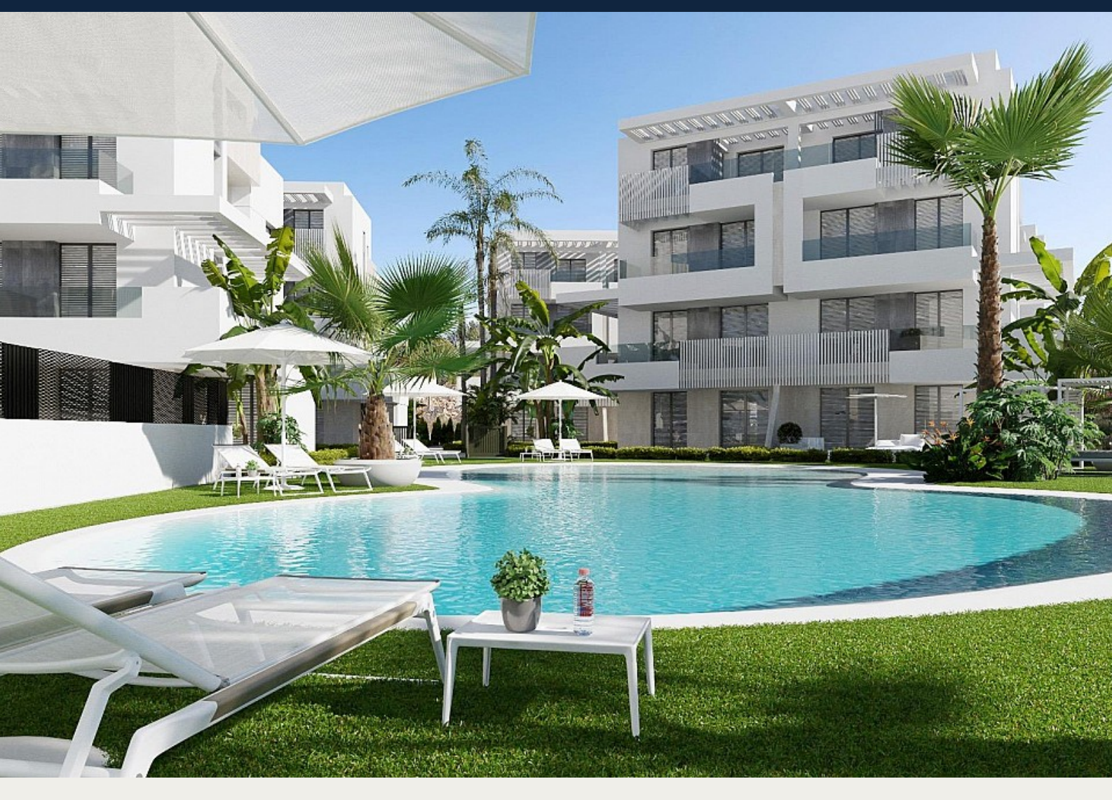
Lejlighed i Torre Pacheco - Nybygget