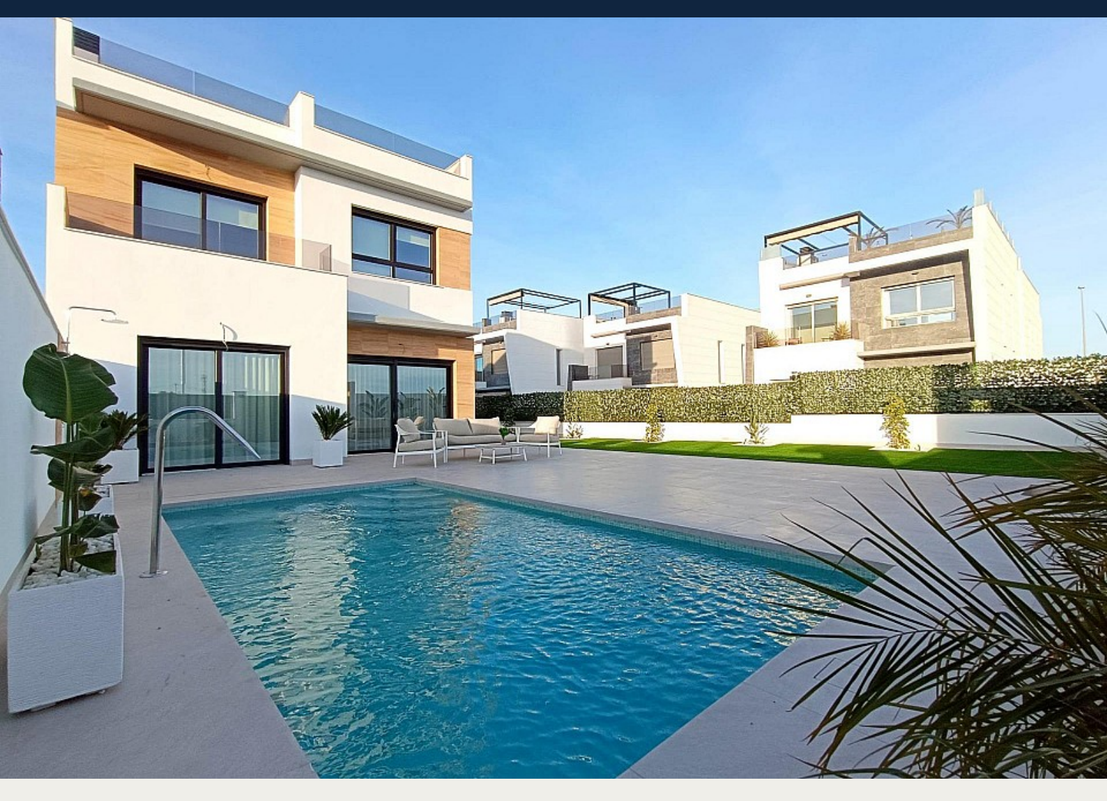
Villa i Benijófar - Nybygget