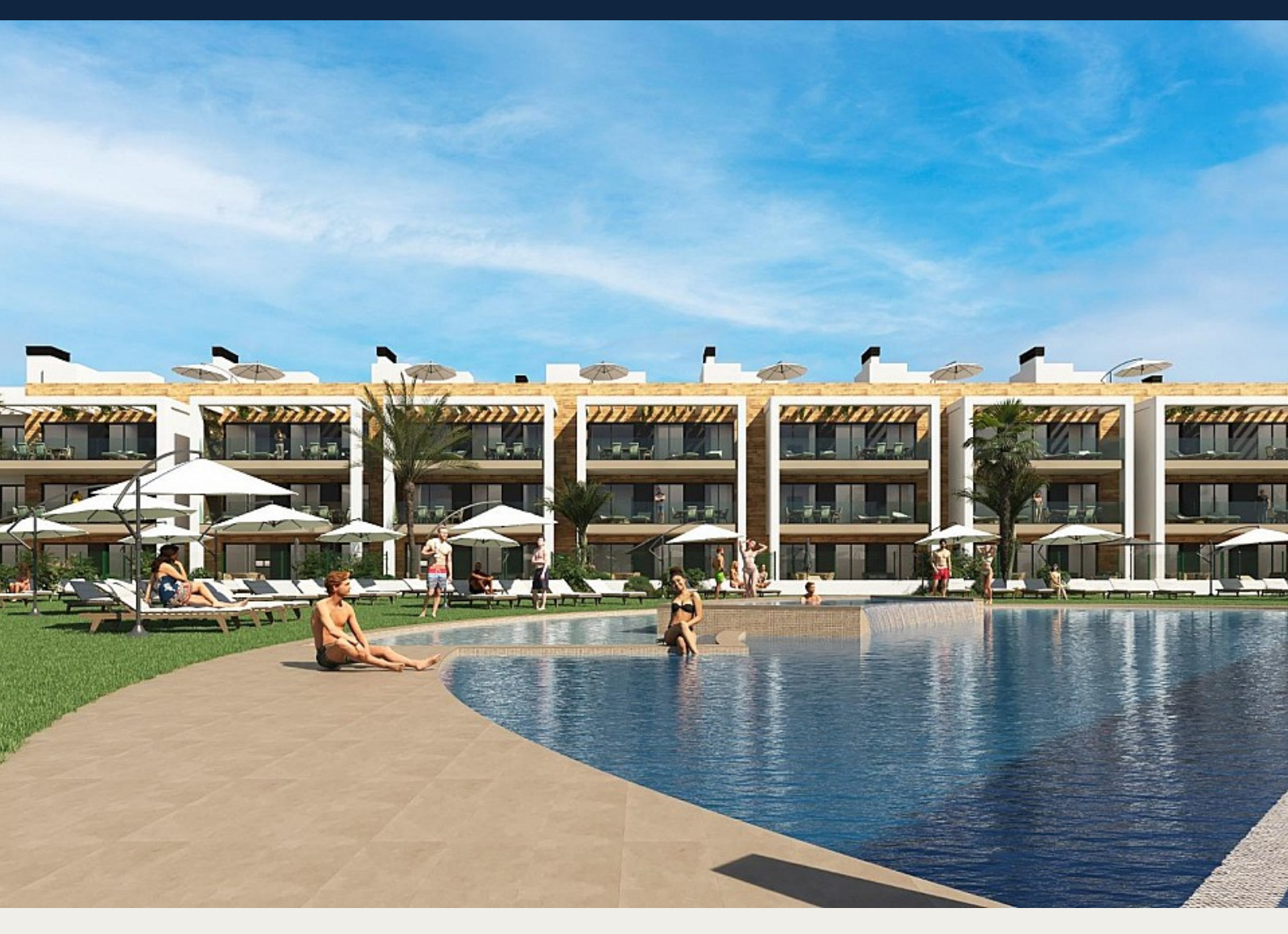
Lejlighed i Los Alcázares - Nybygget