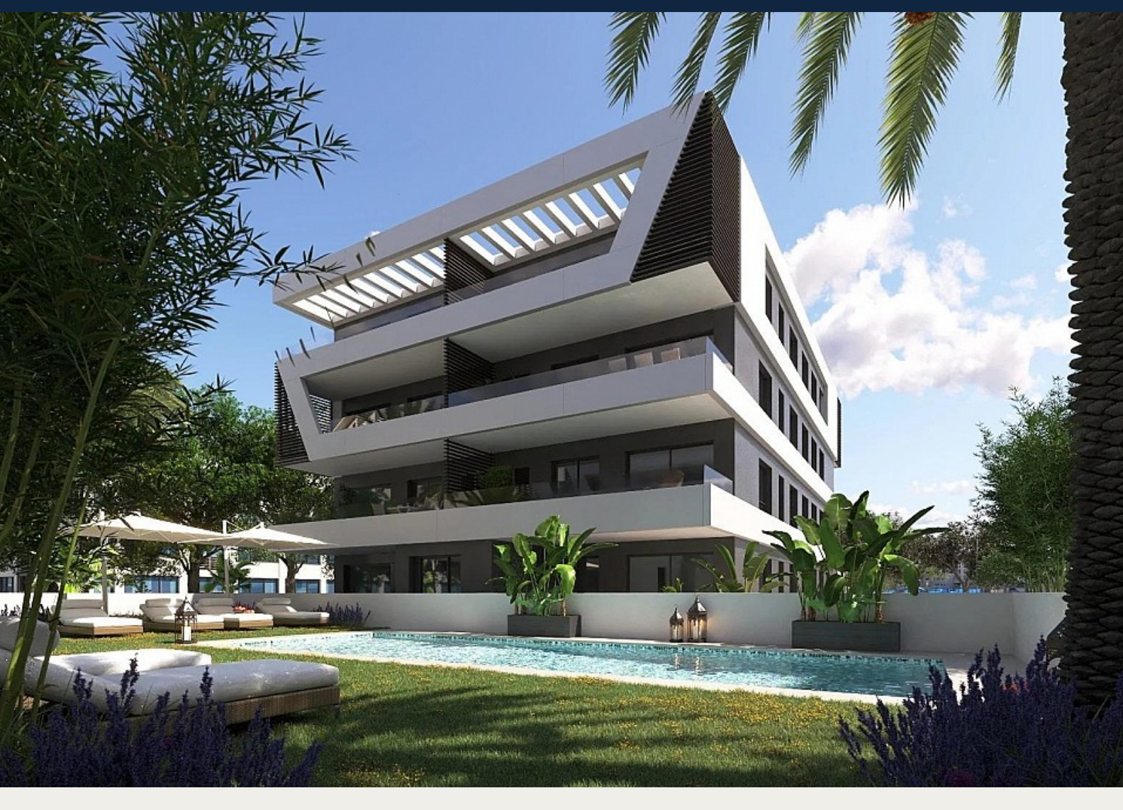
Lejlighed i San Juan Alicante - Nybygget