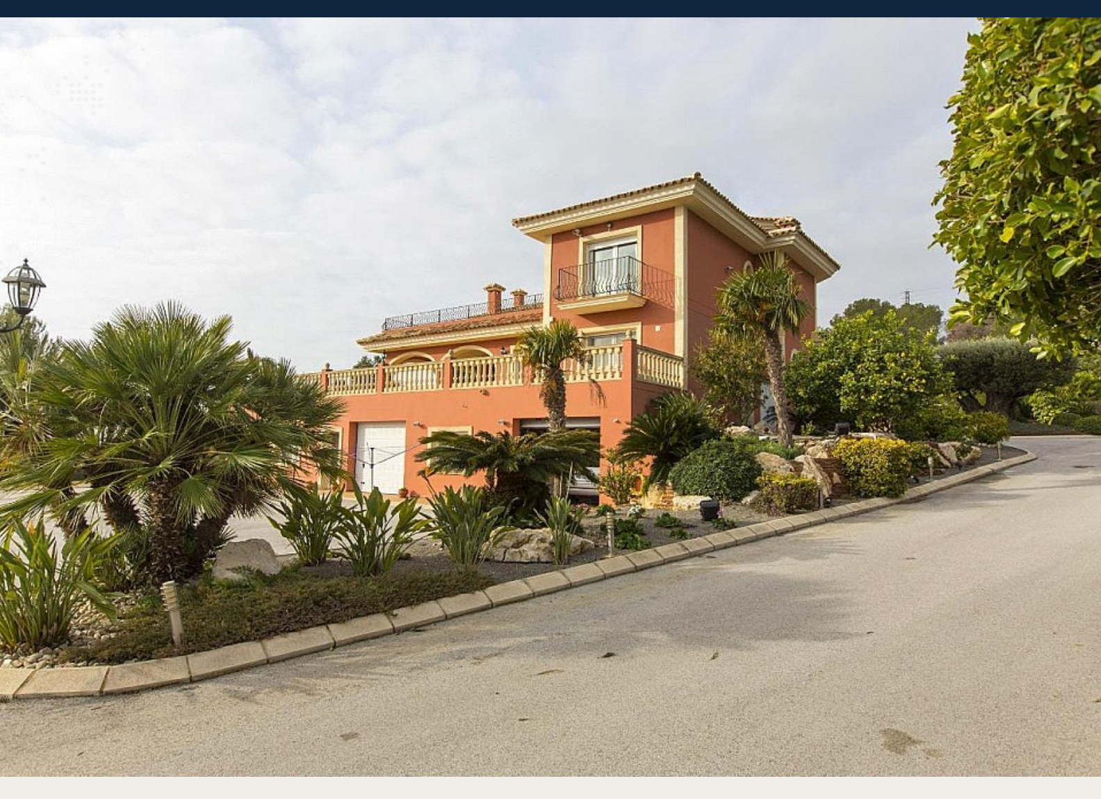
Villa i Alfas del Pi - Gensalg