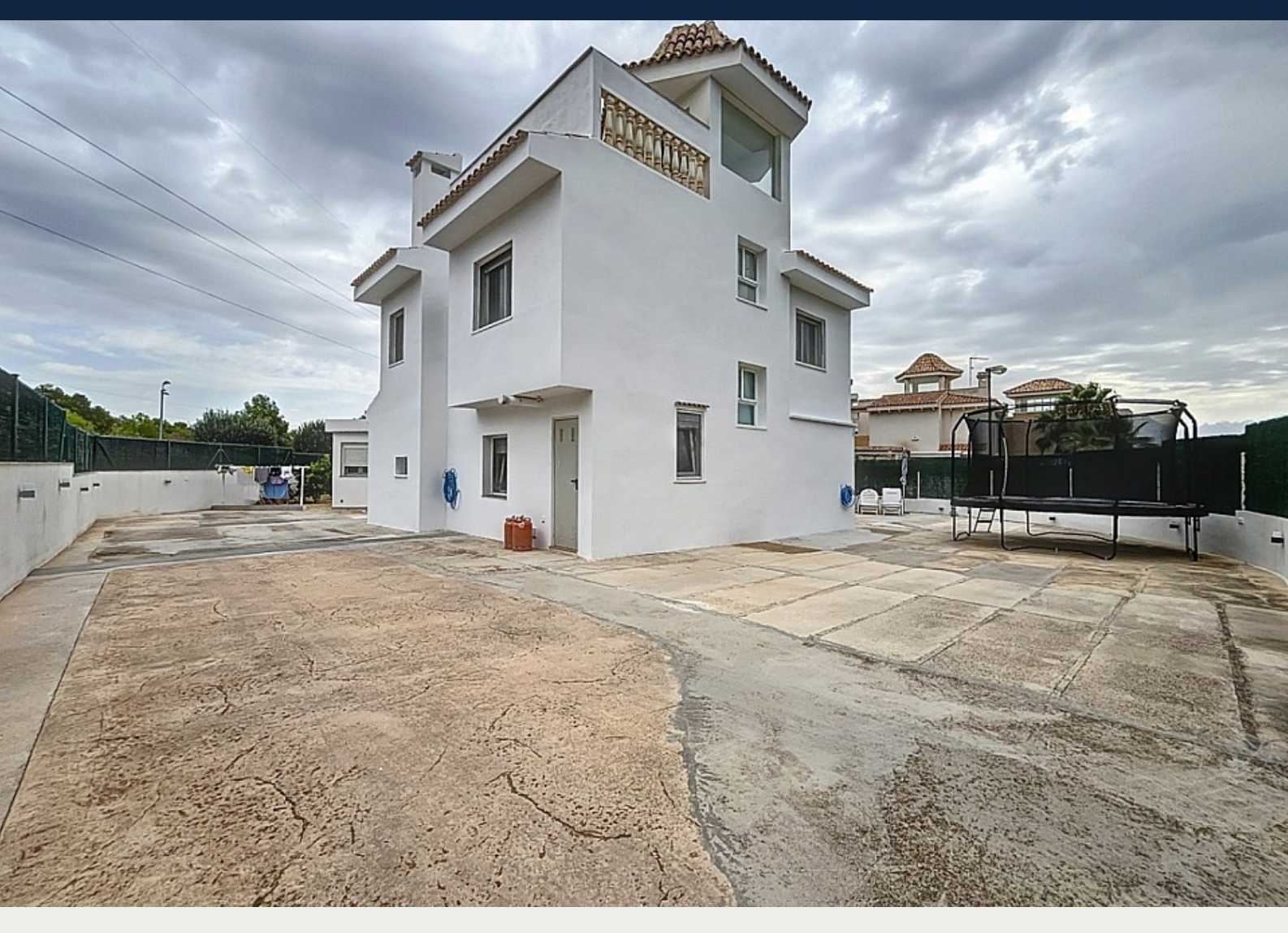
Villa i La Nucía - Gensalg