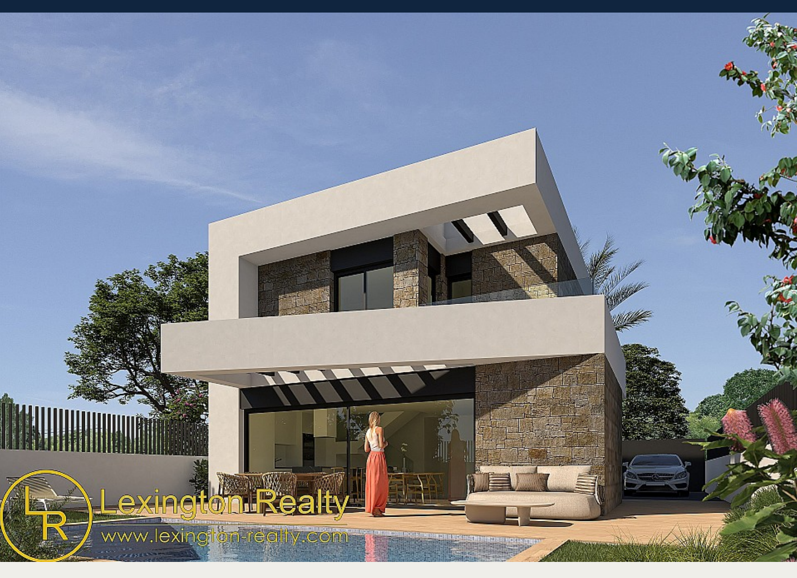
Villa i Finestrat - Nybygget