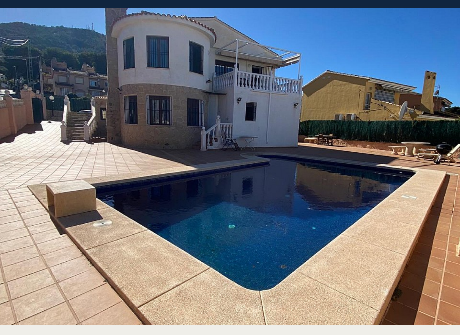
Detached Villa in Albir - Resale