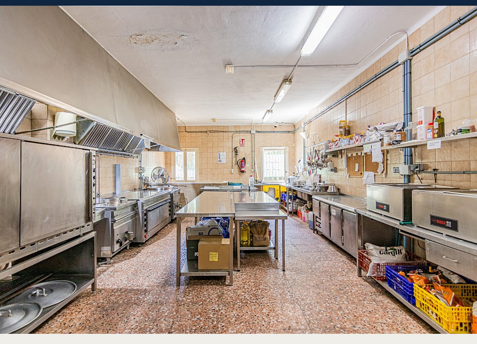
Commercial in Albir - Resale