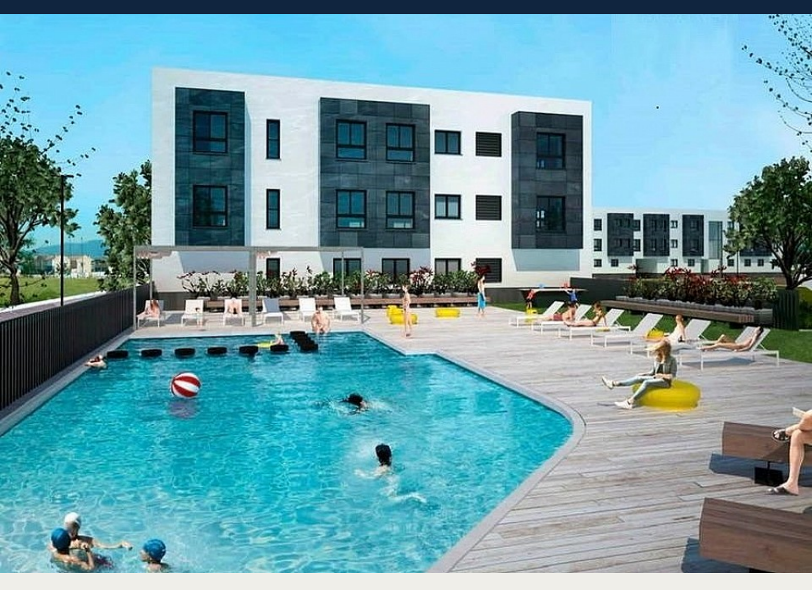
Apartment in Torre Pacheco - New build