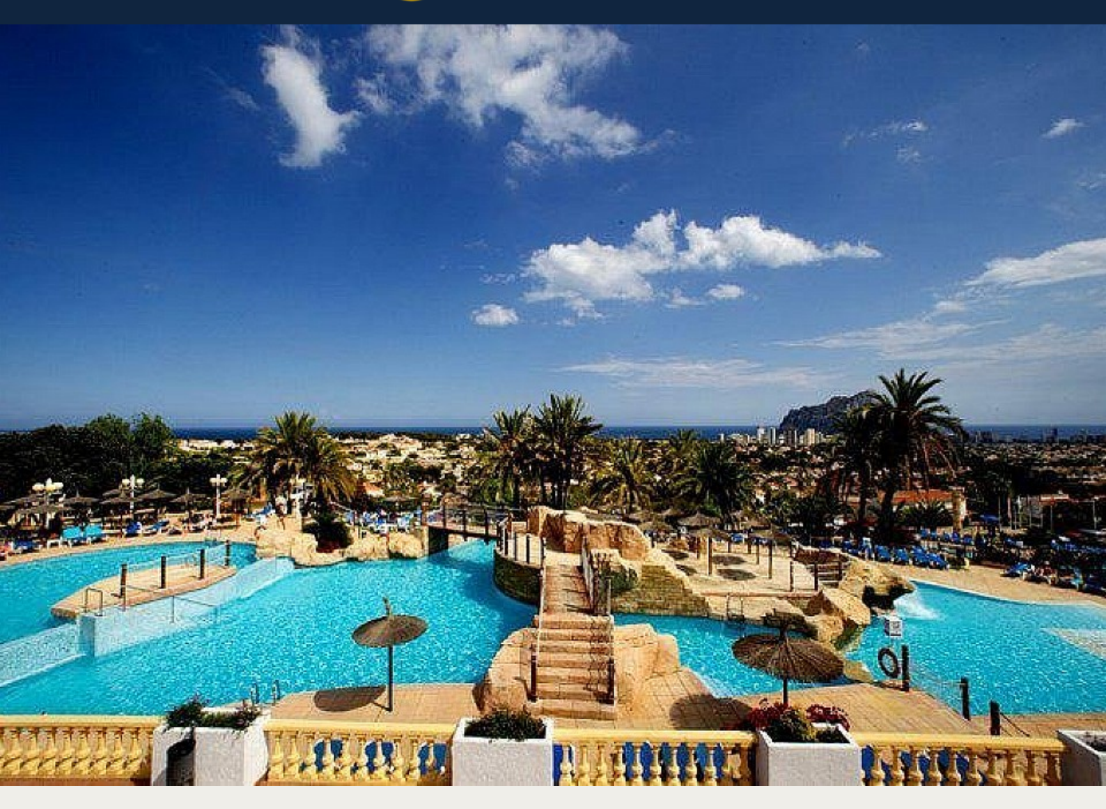
Bungalow in Calpe - New build