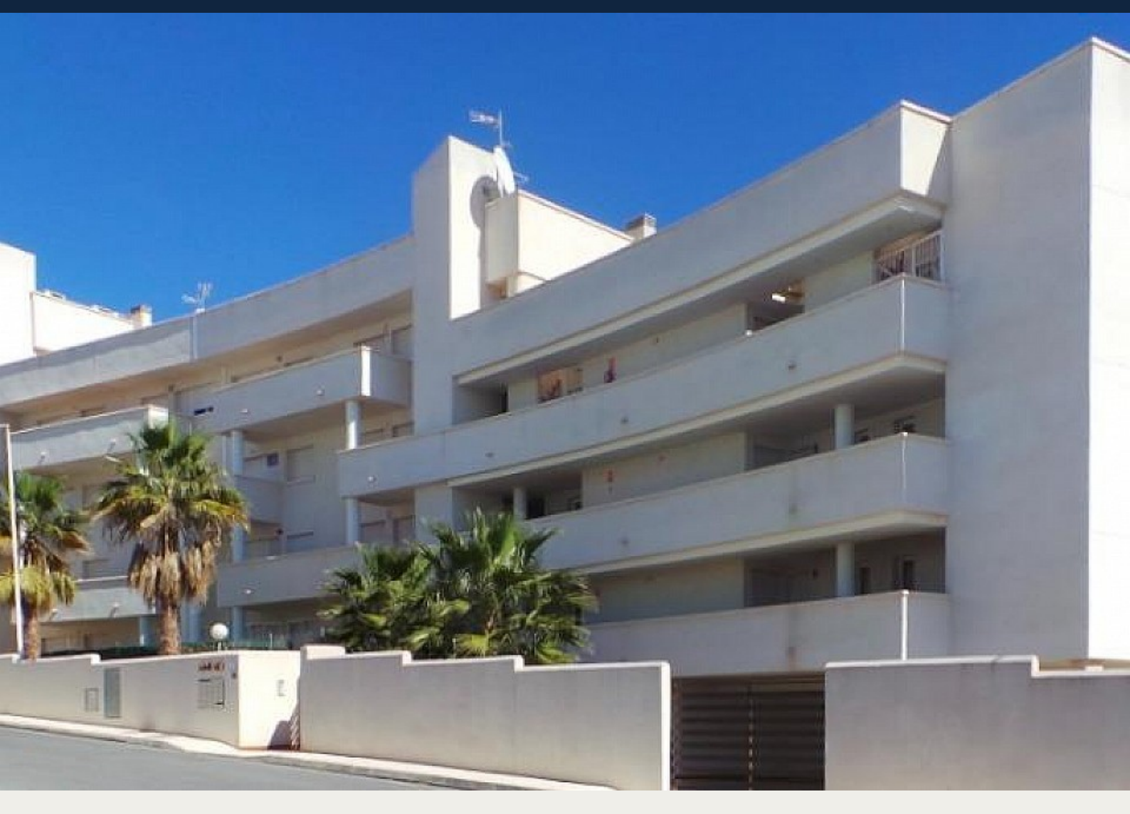
Apartment in Orihuela Costa - New build