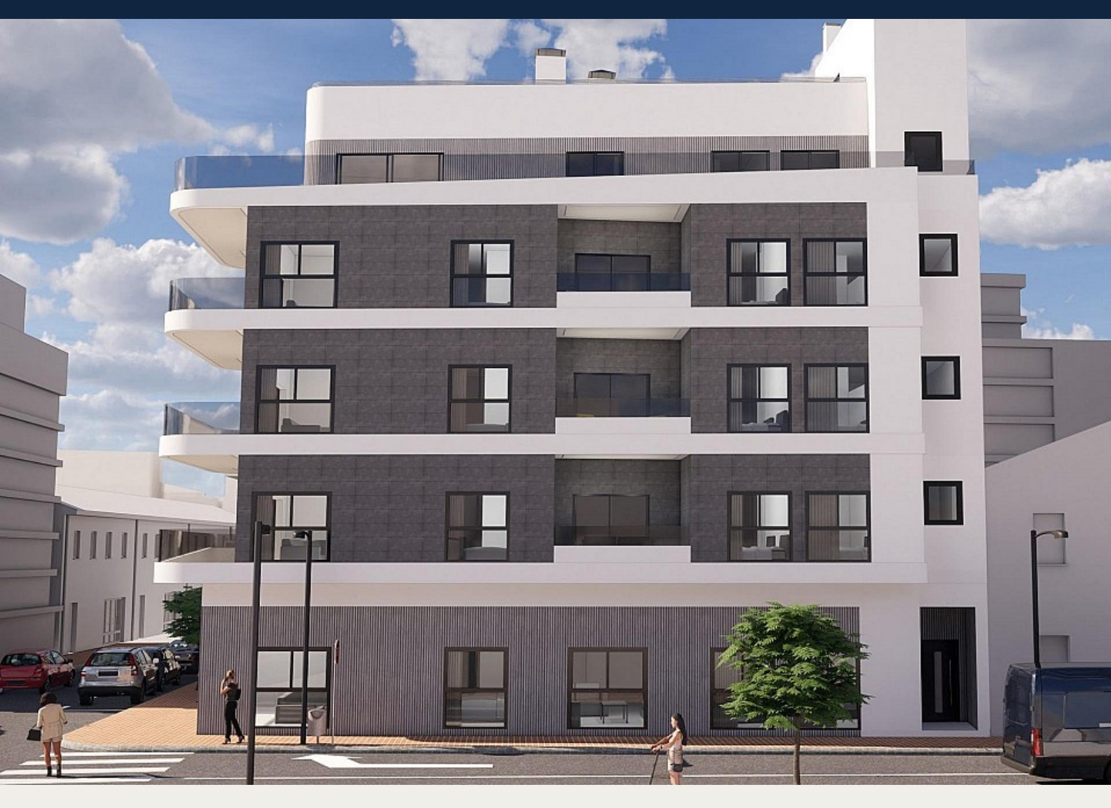
Apartment in Torrevieja - New build