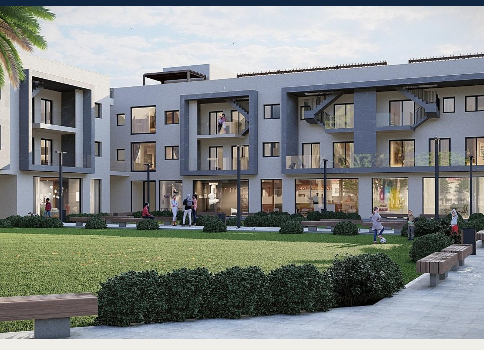
Penthouse in Torre Pacheco - New build