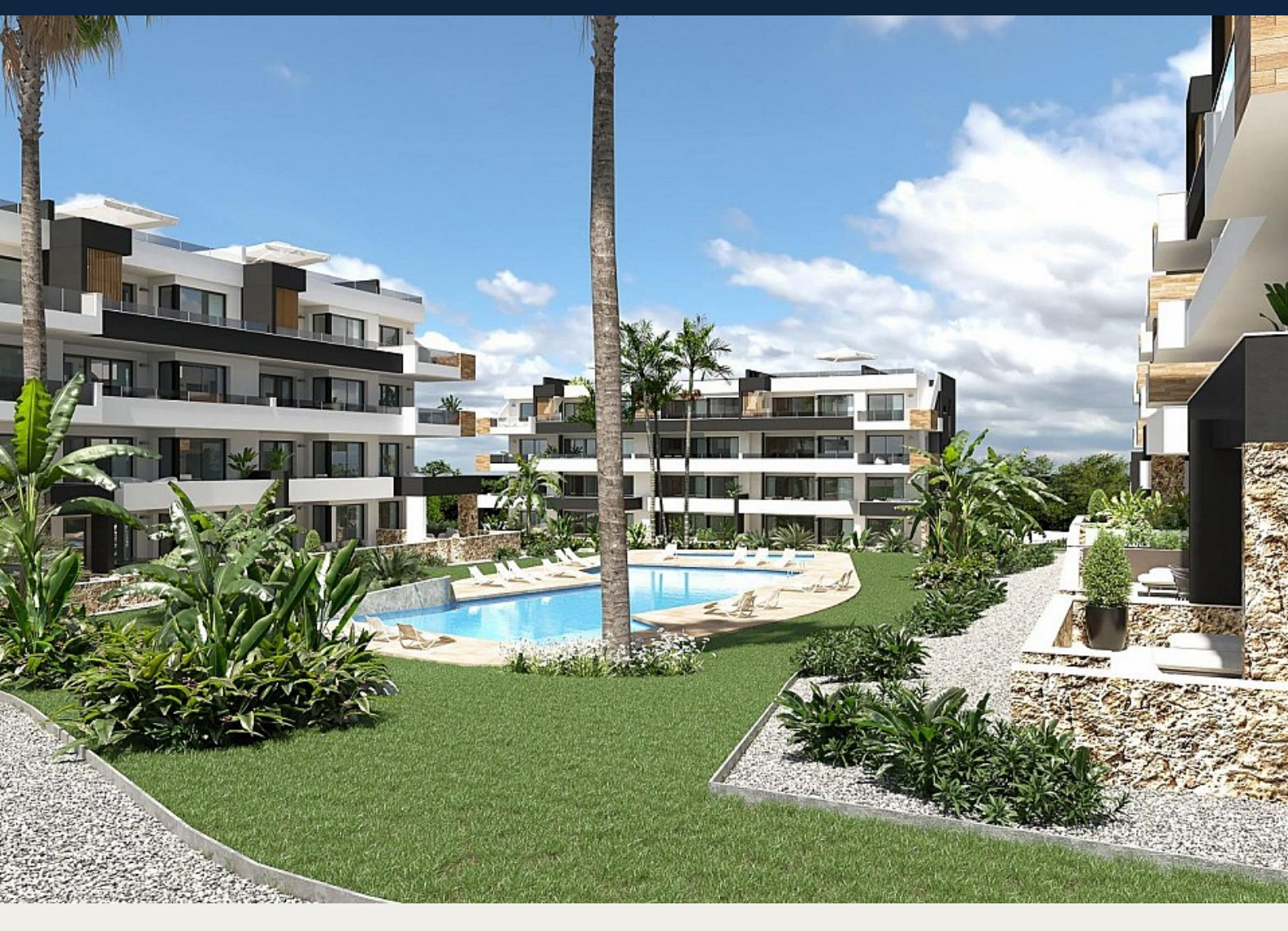
Penthouse in Orihuela Costa - New build