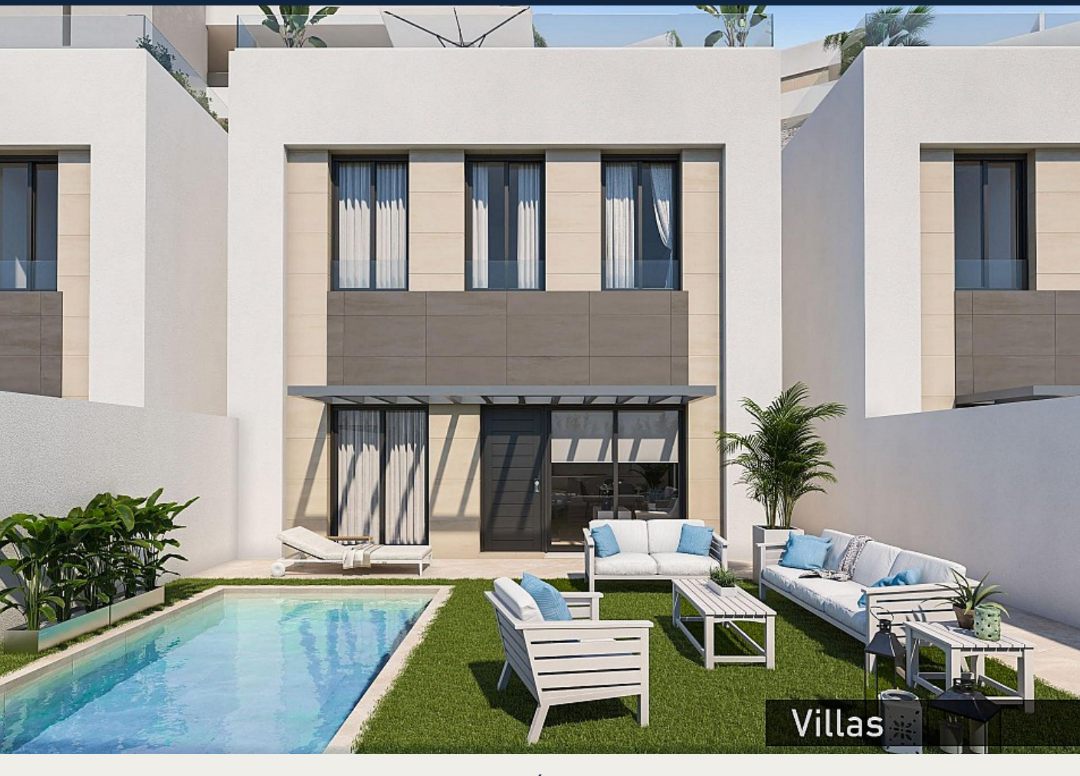
Detached Villa in Águilas - New build