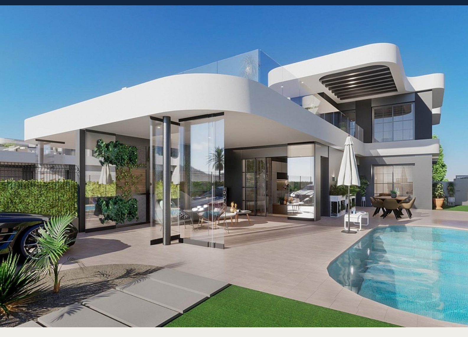
Detached Villa in Los Alcázares - New build