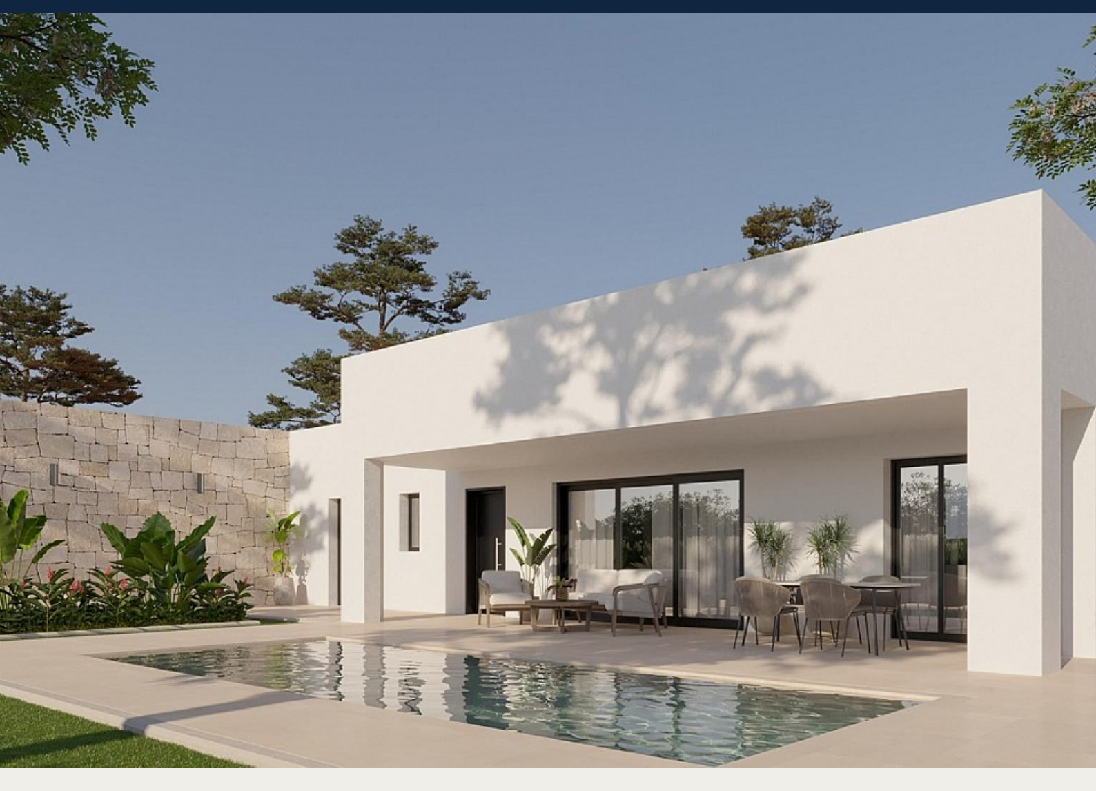
Detached Villa in Pinoso - New build