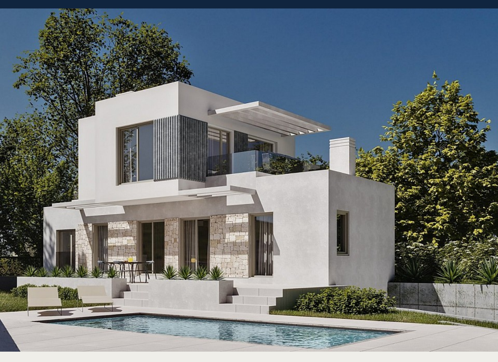
Detached Villa in Finestrat - New build