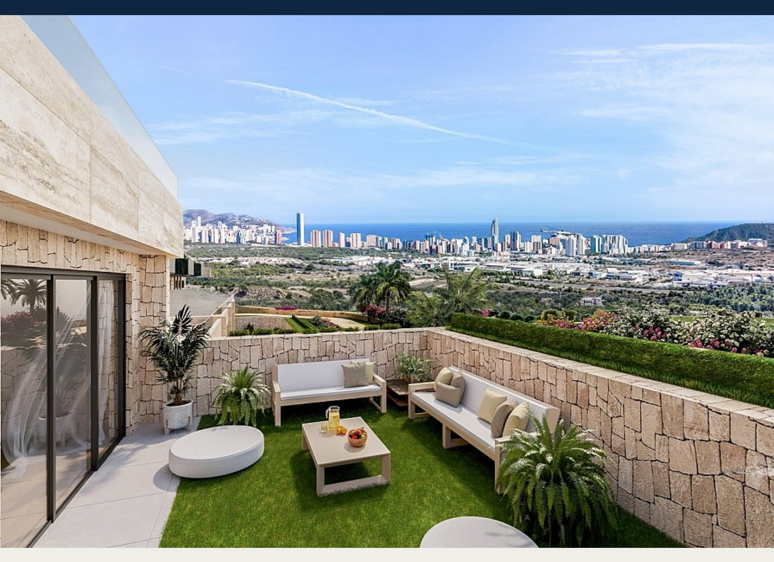
Bungalow in Finestrat - New build