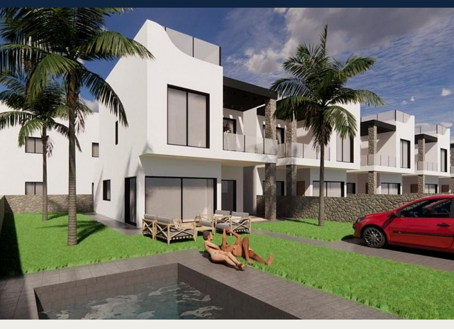
Detached Villa in Orihuela Costa - New build