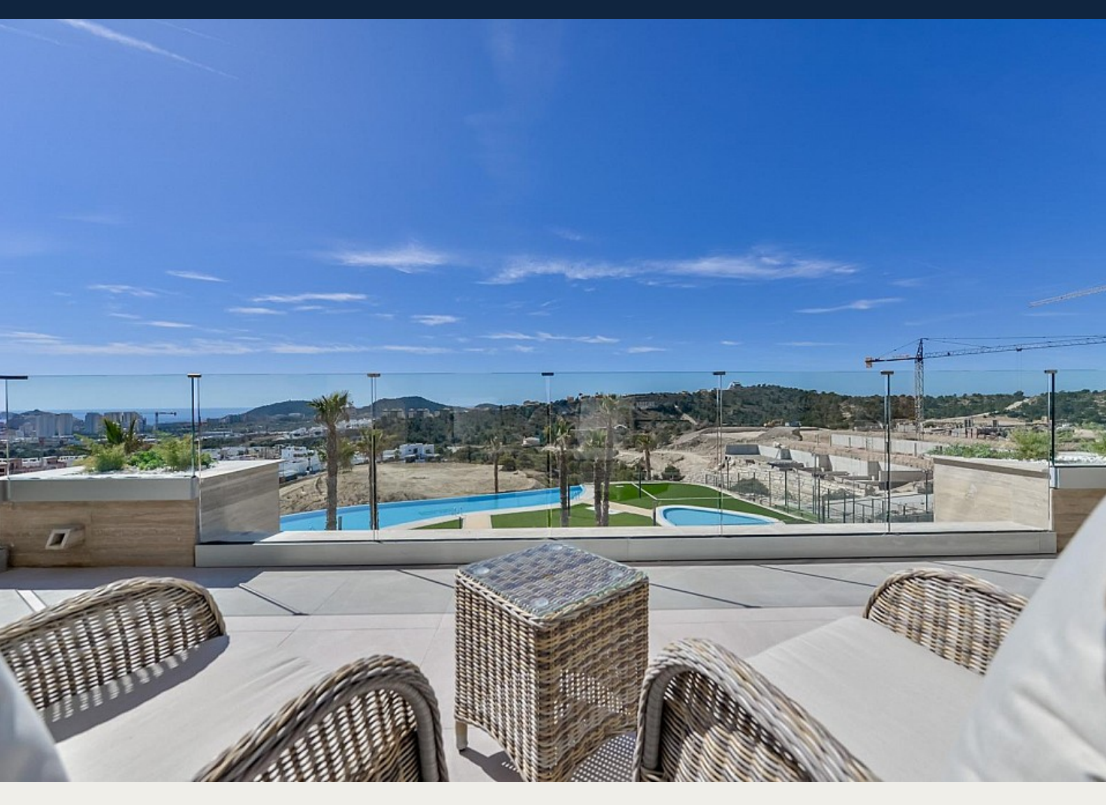
Apartment in Finestrat - New build