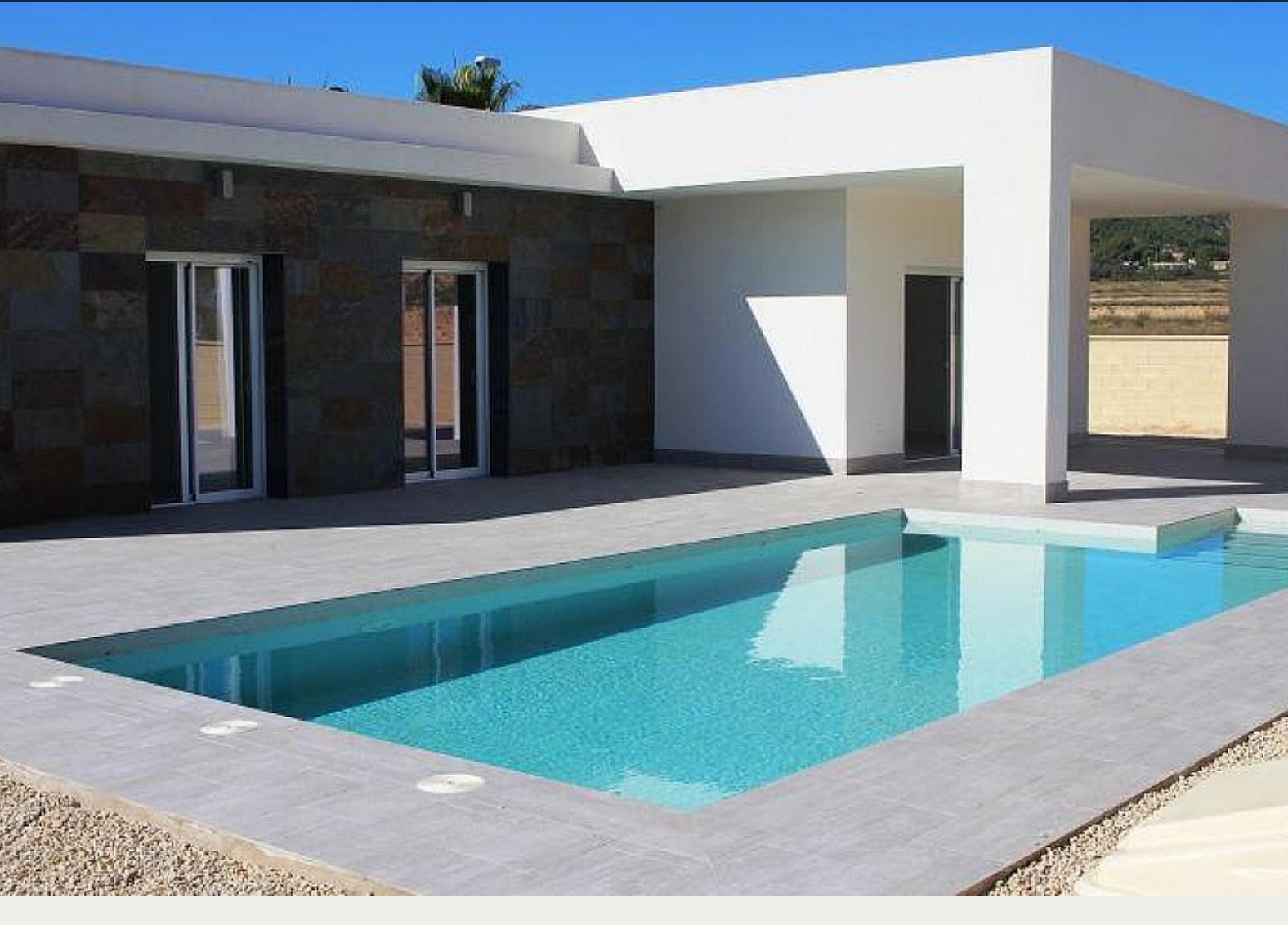
Detached Villa in La Romana - New build