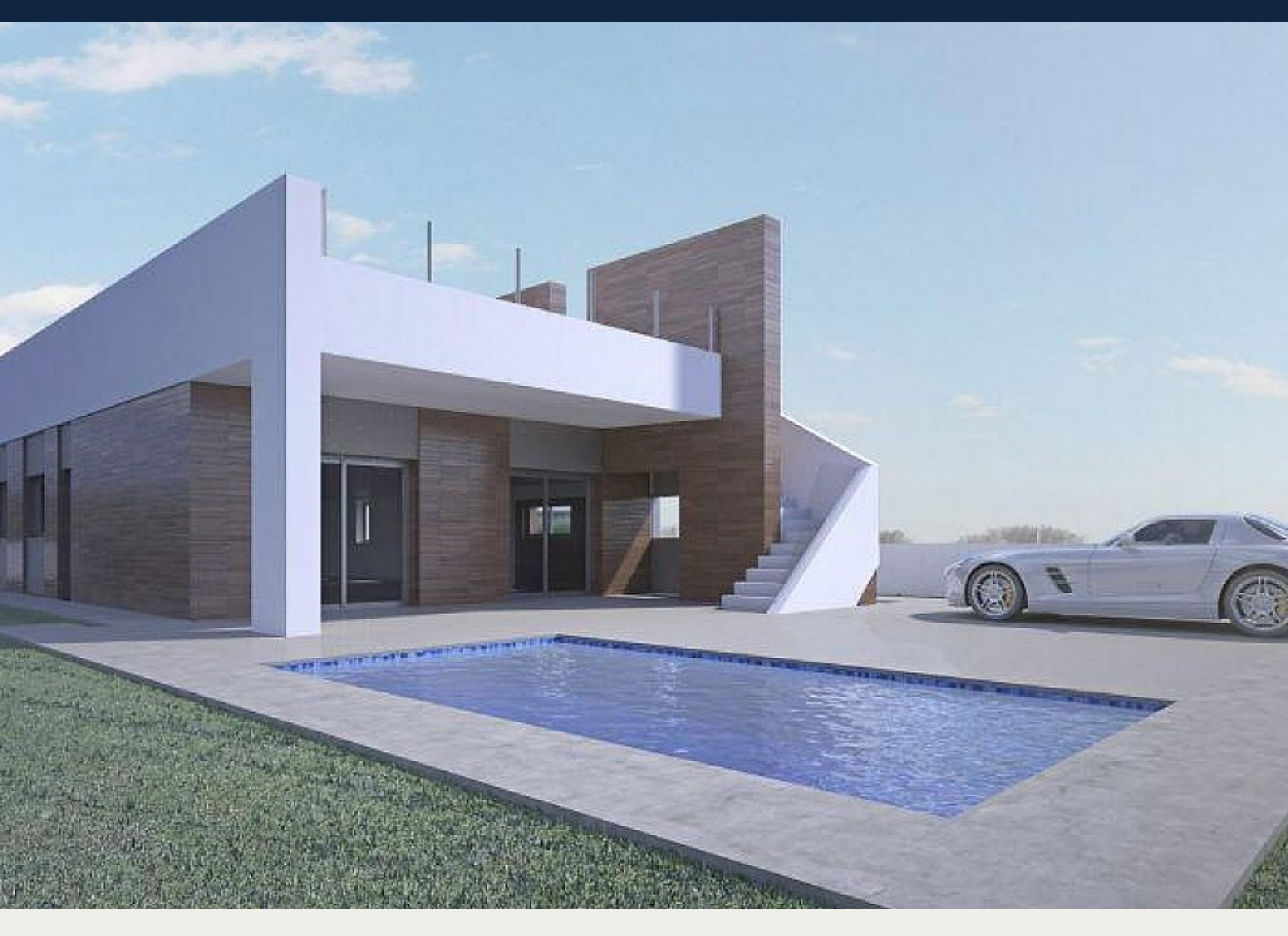
Detached Villa in Aspe - New build